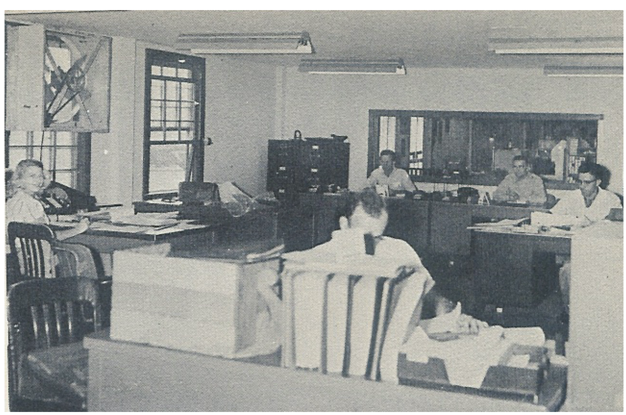
England AFB Commissary Office, 1955