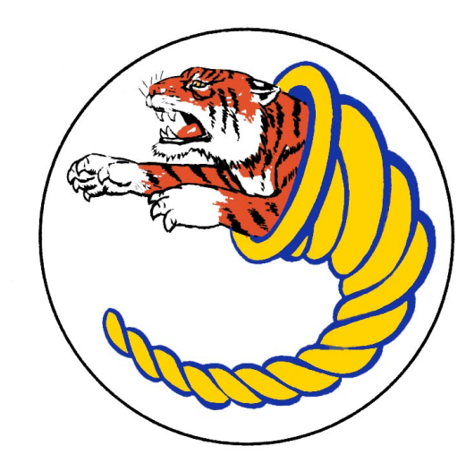
Approved, 1 Nov 1954