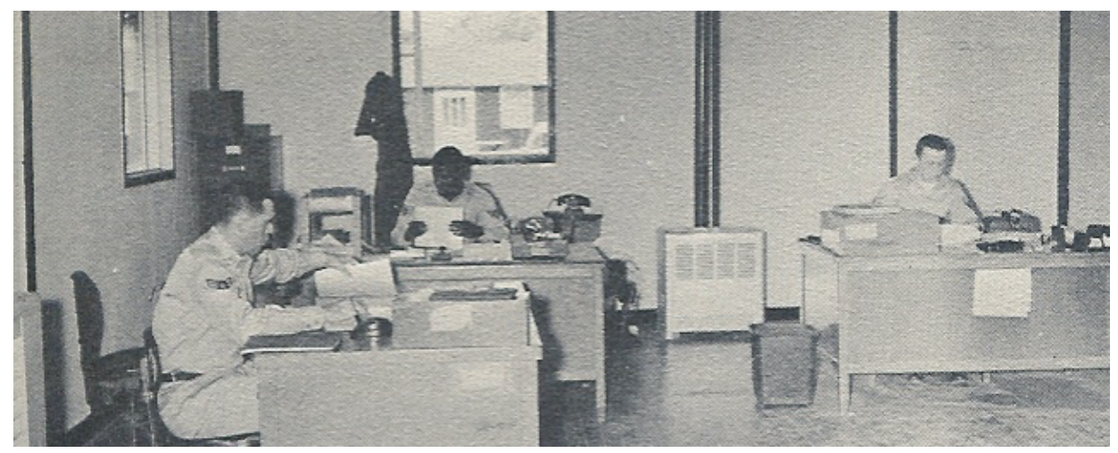
Supply Squadron orderly room, England AFB, LA, 1955